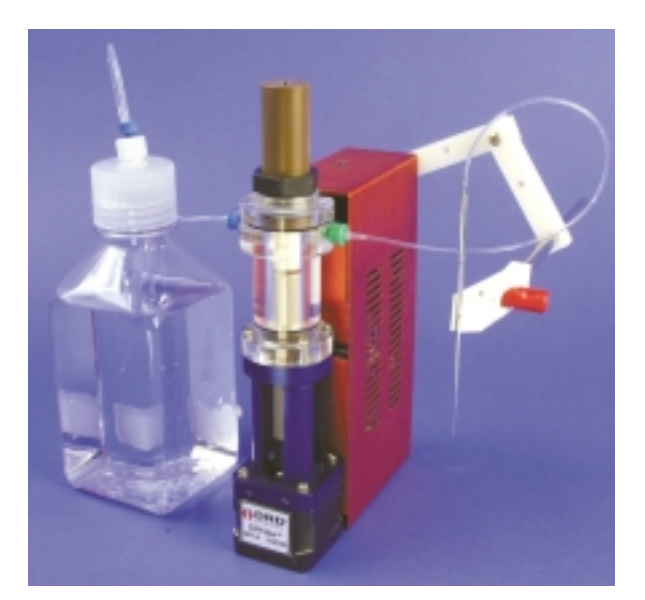
Available as Bare Bones OEM pump modules, or as a Complete Pump or Bench Top Diluter (shown above) with electronic pod and Simple Step™ SSCB control board and RS 232 interface.

**Excursion Power in mm/µL reflects the distance the pump has available to it to move small volumes, the abundance of which (compared with other pumps) reflects DRD pump P&A robustness and longevity (aka DRD Robust Reserve™).